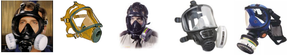
Some examples of full face filter respirators