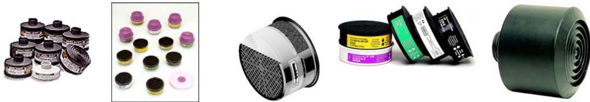
Some examples of filters/cartridges

There are three main types of filters/cartridges: