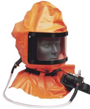
The picture shows a typical supplied air hood