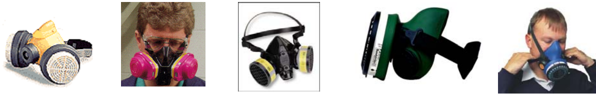
Some examples of half mask filter respirators