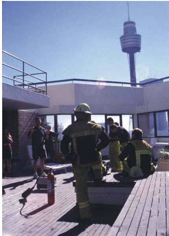
Briefing the NSW fire fighters

Each climber’s breathing was measured during the entire exercise, and later processed to give a detailed picture of the breathing pattern and air requirements. The volume, speed and timing of every single breath was recorded and plotted on a graph.