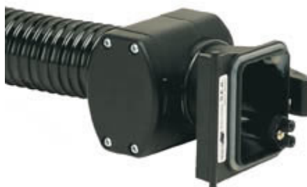
Bleed valve on the breathing hose

This not only contributes to the perceived cooling and ventilation of the suit, but also keeps inward leakage down to 0.1% typically.