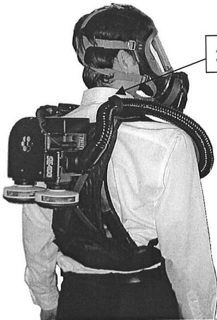
Back Pack with SE400

Hook SE-Talk onto shoulder pad with cable over left shoulder